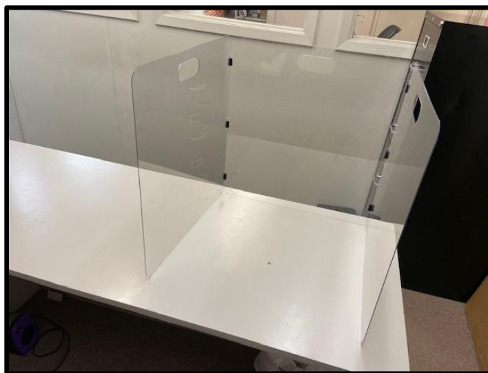
Step 3: Set unit in place.