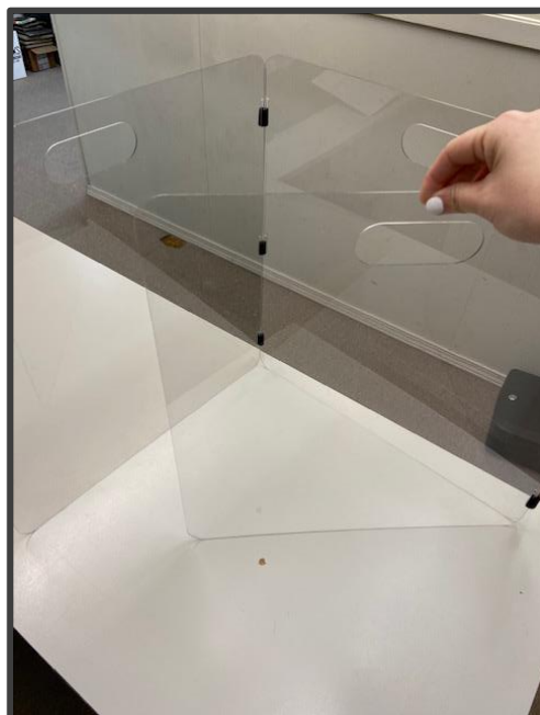
Step 2: Open the sides of the shield so it is supporting itself to stand.