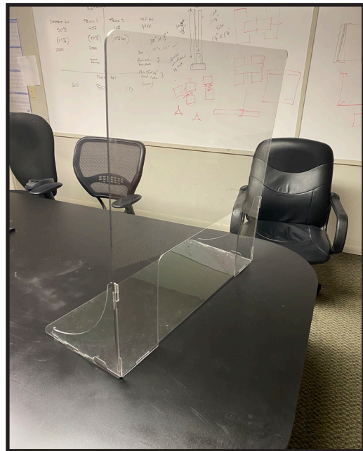
Step 4: Set assembled unit in place and suction cups to surface for stability.