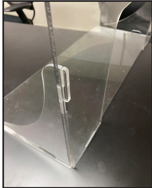
Step 2: Install each of the feet onto the base.