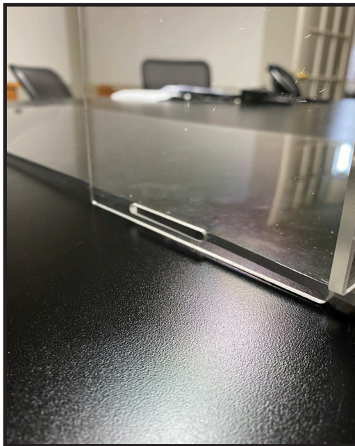
Step 3: Install the face onto the base and feet.